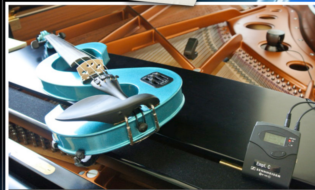
Karlheinz Essl: Stern (2013). Instrumental setup.

“Zusammenbinden. Winden? - Hommage à Schumann“.